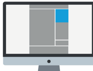
Rectangle medium 300x250px